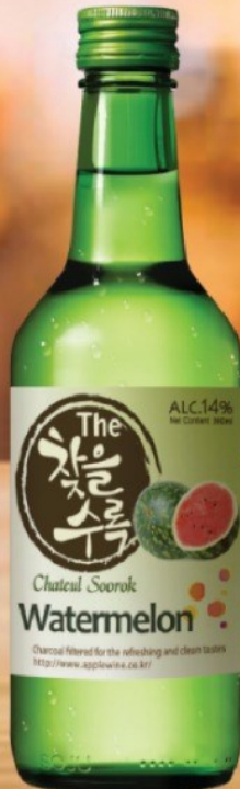
Watermelon RM16.50 + 360 ml