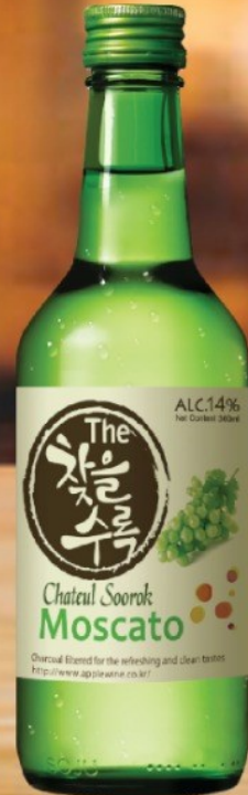
Moscato RM16.50 + 360 ml