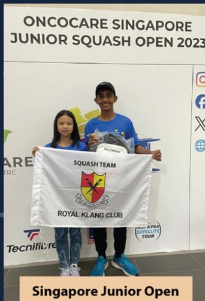
Singapore Junior Open