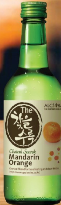
Mandarin Orange RM16.50 + 360 ml