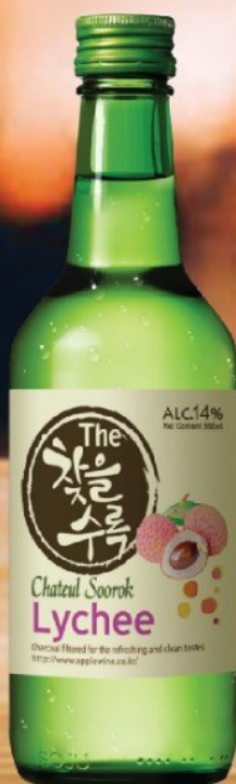
Lychee RM16.50 + 360 ml