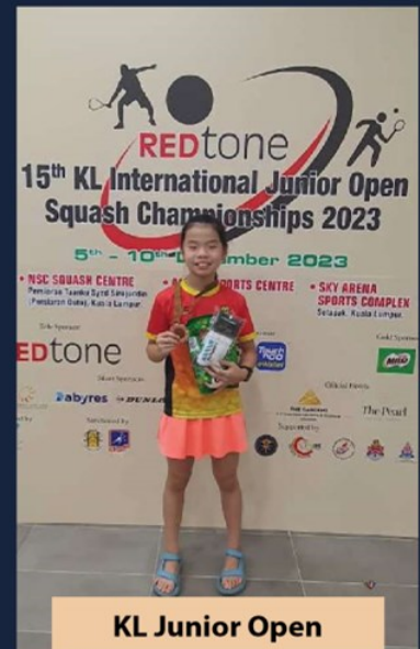
KL Junior Open