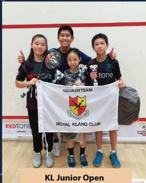
KL Junior Open