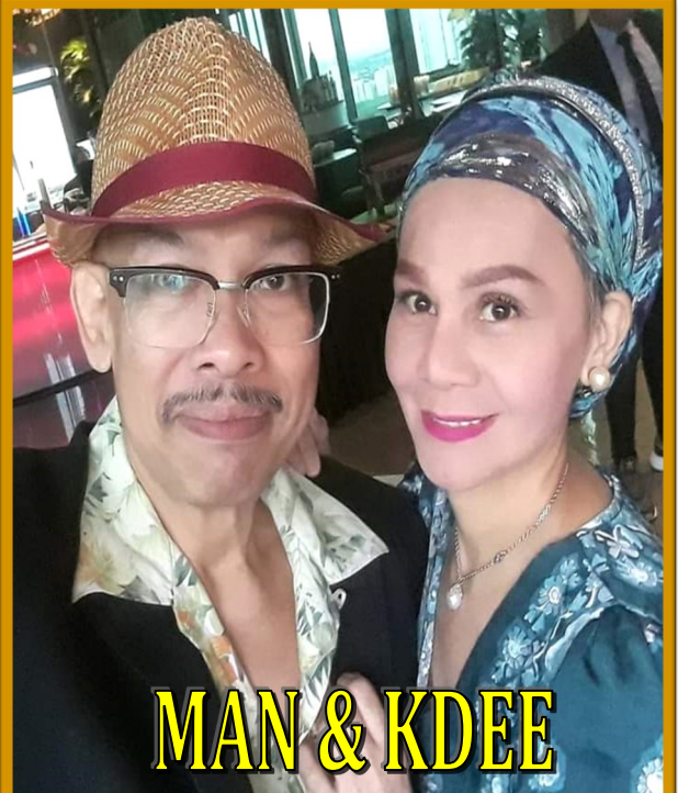
MAN & KDEE