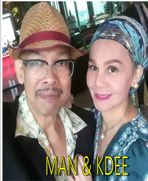
MAN & KDEE